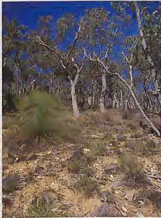
Figure 1A. Stylidium armeria subsp. pilosifolium plants in situ at Riddells Creek; 1B. Low heathy woodland at Riddells Creek with stunted Eucalyptus dives to c. 5 m high on skeletal, shaly ground.